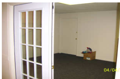
New Waiting Area for our homeless families

MLM's homeless program doubled in size recently. MLM is now serving homeless families as well as homeless individuals. MLM added a new "kid-friendly" waiting area for these families when they visit MLM.