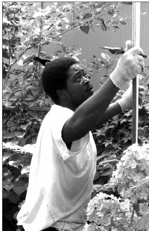
Volunteers worked inside and out Aug. 6 for a special servant day event.

• Vital services performed consistently and effectively: During its 38-year history, MLM has been one of Kansas City's pioneering social services agencies, sponsoring new and innovative housing and emergency assistance programs, including Grace Homes (which provides housing for chronically homeless and chronically mentally ill people in Kansas City, Ks.). MLM founded Harvesters Food Bank and is still one of Harvester's largest food distributors. Most importantly, MLM