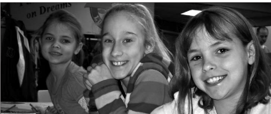
Many smiles were part of the successful Spring Fling that raised funds for the MLM Christmas Store.